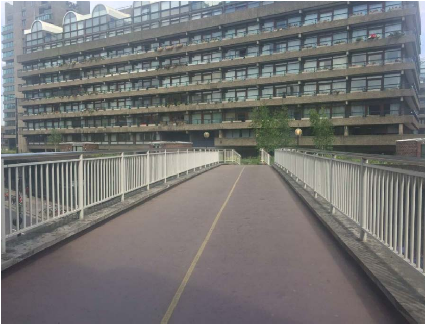
Existing view of the footbridge above Aldersgate