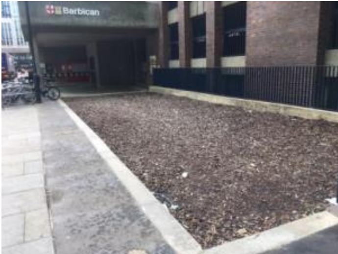
What the site looked like before