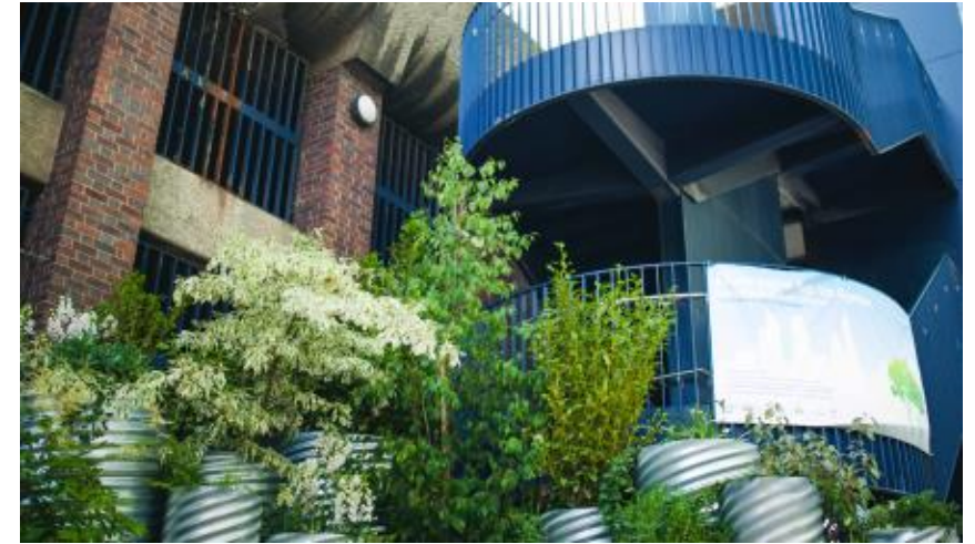
Plants and trees with banner telling people about the Pop Up Garden

The garden is made up of plants with hairy leaves or stems designed to capture and mitigate particulate air pollution and improve biodiversity. The pop-up garden was launched on the 15 th June as part of National Clean Air Day events in the City of London.