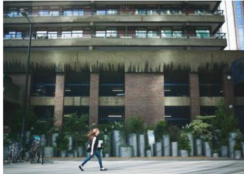
What the site looked like after installation