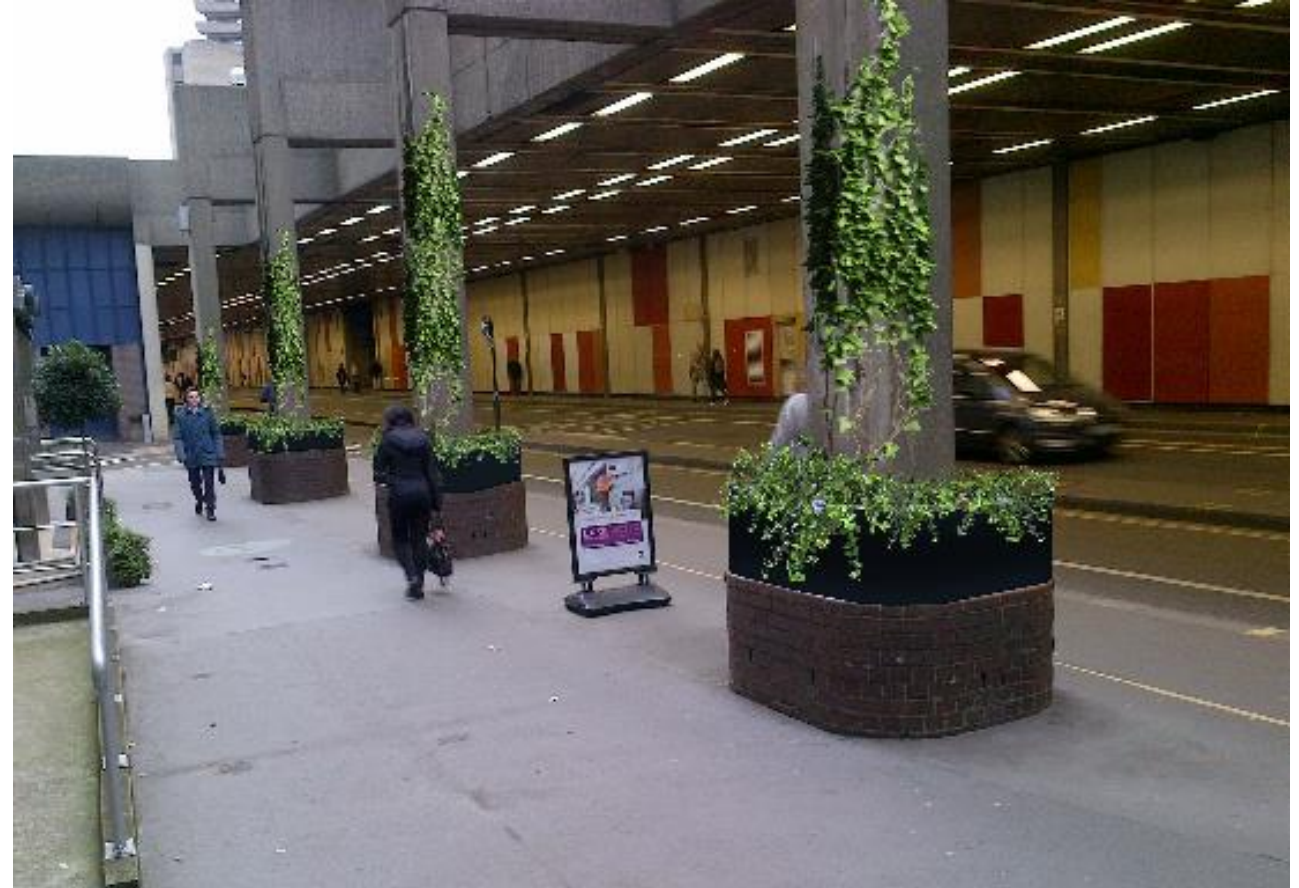
Visualisation of proposal for planters and climbers on columns. Note that the image shows Ivy plants however final recommended plant will be Jasmine (Trachelospermum)