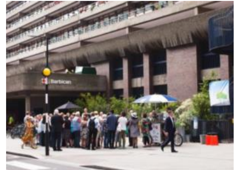
Residents & stakeholders gathered at the launch event