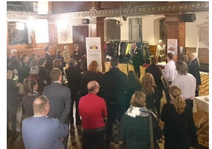
Clean Air Gardens celebration event