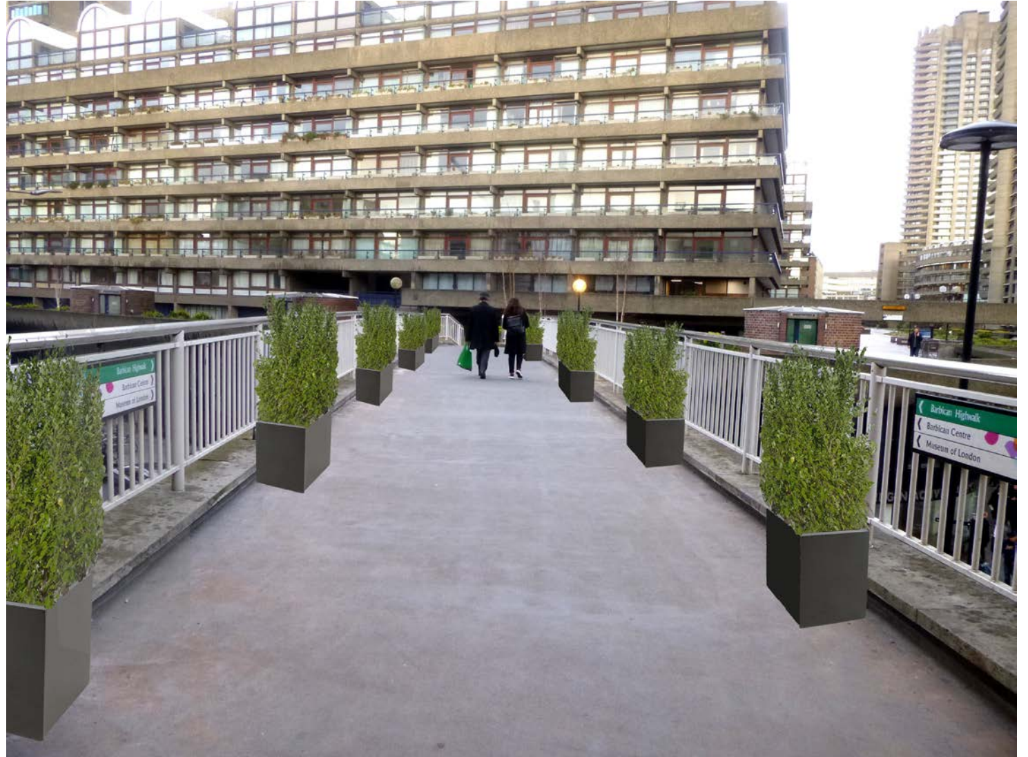
Visualisation of the footbridge with the planters in place