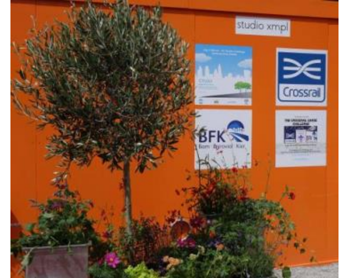
Crossrail site pop up garden

A celebration and presentation event was held in November 2017 to mark the achievements of all volunteers and businesses who were involved in the challenge.