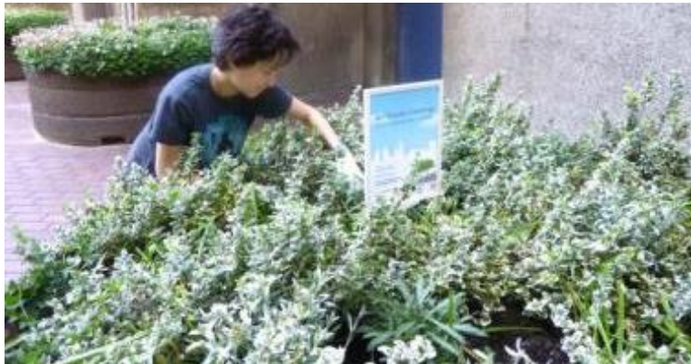
Lauderdale Place planter

Plants to capture and mitigate particulate air pollution