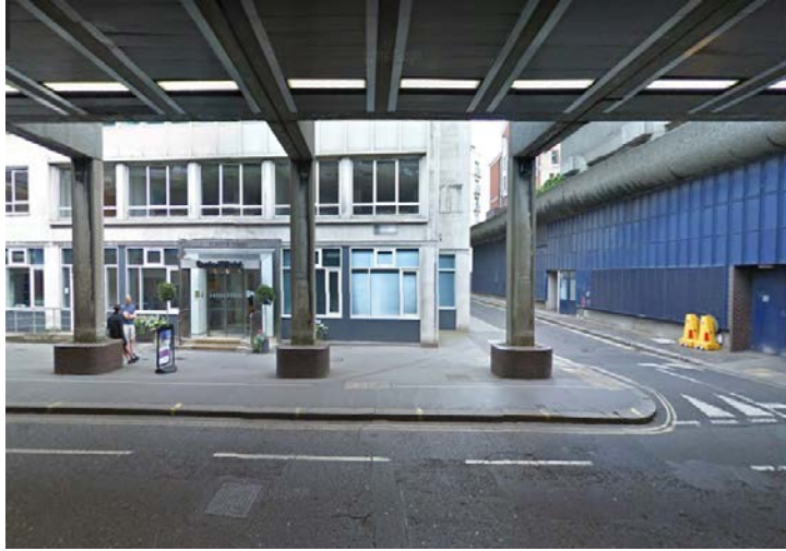
Current view of columns outside 45 Beech Street (Central Point)